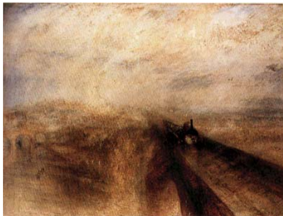
Fig. 2. Rain, Steam, and Speed . Joseph Turner.